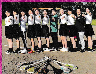
Lacrosse Students in the lacrosse club