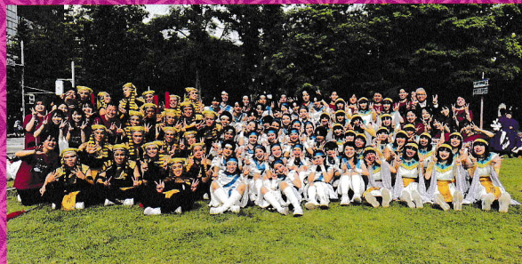
Yosakoi Many Fuji students participate in Sapporo's yearly Yosakoi dance festival.

Fuji WU offers more than 40 student clubs. These clubs give students the opportunity to meet new people and try different activities, ranging from traditional Japanese cultural activities like tea ceremony and calligraphy, to modern dance, music, and sports clubs. Students may also join clubs at other Sapporo universities, such as the nearby Hokkaido University (less than a 10 min walk from FWU).