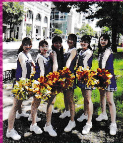
Cheerleading Fuji students in the Wisteria Cheer Club