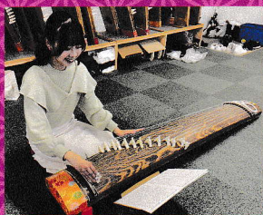
Soukyoku A student plays the Koto in the Soukyoku Club