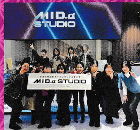
Broadcasting Fuji students gain experience broadcasting in the Studio Club